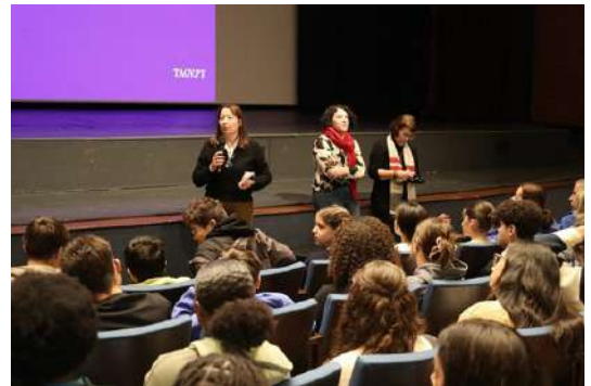
“The cinema awaits you” initiative, with a screening of Andrew Levitas' film “Minamata”